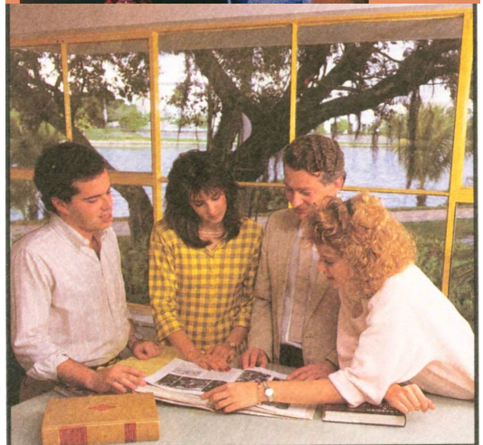
As Interim Dean with students, 1983